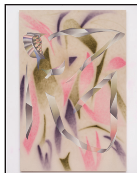
CW Landon Nude Fables, 2023 Oil and acrylic on canvas 180cm x 120cm