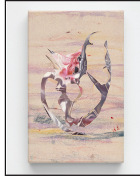
CW Landon Heuristic Bloom, 2024 Signed CW Landon 2024 Oil and acrylic on canvas 25cm x 40cm