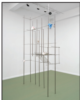
CW Landon Address 42, 2024 Plaster, wire, mild steel, bronze and sugar 242cm x 128cm x 60cm