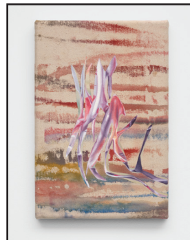
CW Landon Bayesian Inference, 2024 CW Landon 2024 Oil and acrylic on canvas 20cm x 30cm