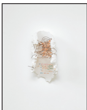
CW Landon Untitled, 2024 Plaster, wire, watercolour, mild steel hydraulic tubing 20cm x 10cm x 10cm