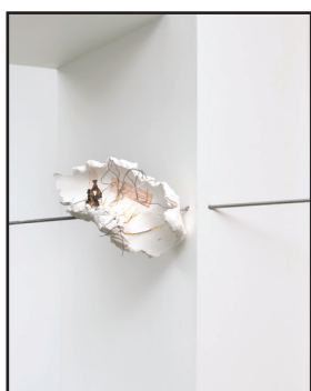
CW Landon Leeway, 2024 Plaster, wire, mild steel hydraulic tube, water colour, bronze 17.5cm x 90cm x 30cm