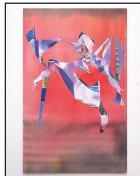
CW Landon Mobility Receipt, 2024 Oil and acrylic on canvas 190cm x 120cm